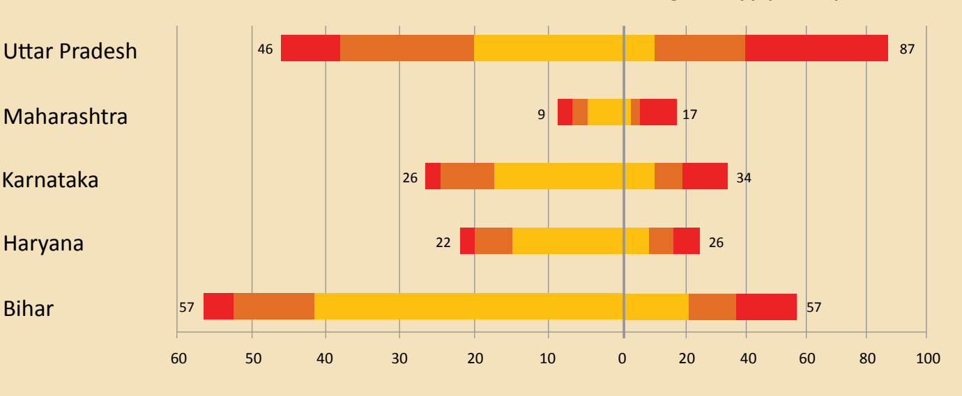
Average no supply hours per location

■ 15 min - 1 hr ■ 1 hr - 3 hrs ■ > 3 hrs